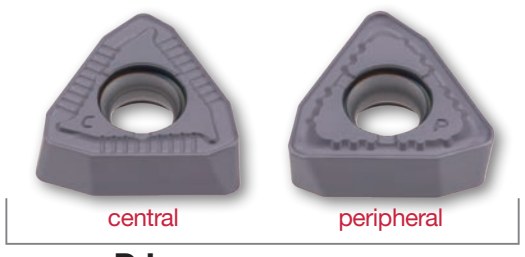
DJ type (for general purpose)