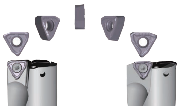
One insert type for both the central and peripheral pockets