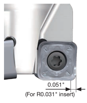
8 cutting edges

No interference with side walls, fixtures, and clamping systems