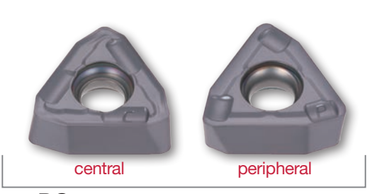
DS type (for stainless and gummy steels)